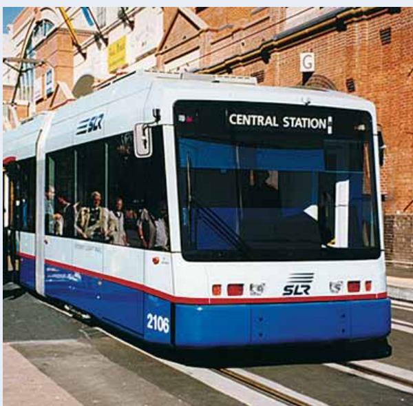
New study to look at light rail extension.

The NSW Government has called for tenders to carry out a light rail extension assessment study.