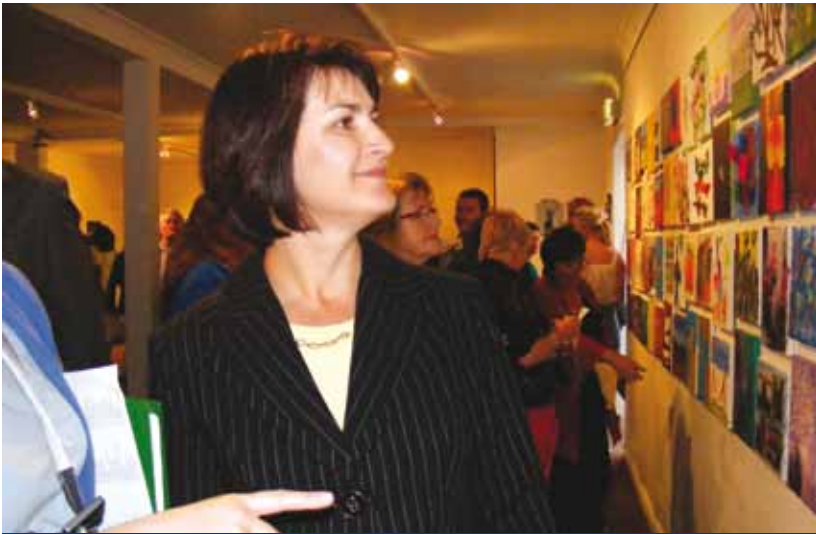
Inspiring artwork at the Addison Road Gallery.