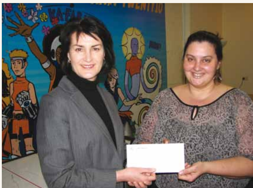
Carmel Tebbutt congratulates Twenty10 on receiving a $5,000 grant.

“Twenty10 is a great local organisation which ensures that all young people have more opportunities to participate in our society,” said Carmel Tebbutt.