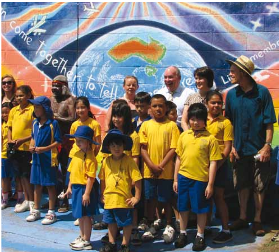
Proud students help create images for school mural.