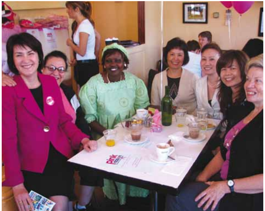
Residents who attended the Pink Ribbon Breakfast helped raise over $1,700 by way of donations and purchase of Pink Ribbon merchandise.

For more information on BreastScreen, a free breast screening service run by NSW Health for women aged 50 to 69 years, call 13 20 50 or visit www.bsnsw.org.au